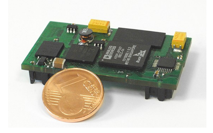
Miniature size Blackfin Module compared to the size of a one cent coin

A motherboard for one BFLANcore board with many I/O signals accessible at 100mil header plus JTAG headers for easy evaluation, a suitable power supply and JTAG headers is available on request.